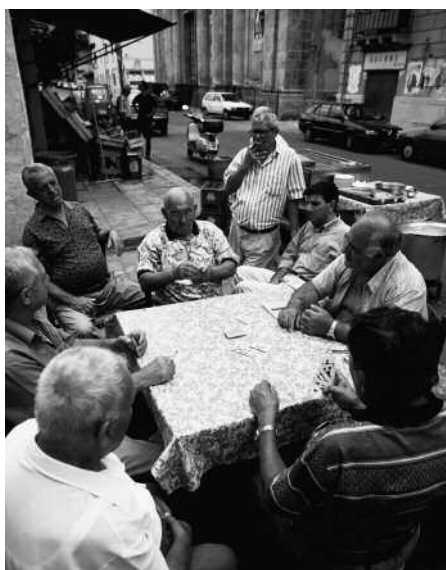
Games of chance are viewed differently across the Union. Palermo, Sicily.

The application of the proportionality test to national measures is all the more delicate where the ECJ is operating in an area where significant discrepancies exist between the regulatory approaches of the Member States. Where Member States share broadly similar views about the content of a particular type of policy objective, such as consumer protection, fighting