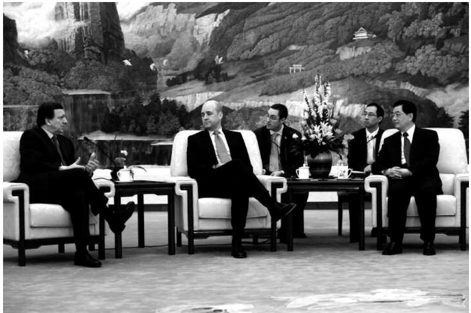
The European Commission president, José Manuel Barroso, and Sweden's prime minister, Fredrik Reinfeldt, meet China's President Hu Jintao at last November's EU-China summit, Nanjing.

The EU's external powers—its catalogue of competences—did not substantially expand when Lisbon entered into force, with one major exception. The common commercial policy now extends to 'foreign direct investment' (Article 207 TFEU). With a tick of the clock, an important area of international law has come within the