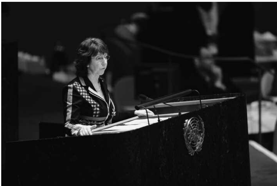
Uncertain role: the EU's High Representative for Foreign Affairs and Security Policy, Catherine Ashton, speaks at the UN headquarters in New York, 3 May 2010.

One way in which the new Treaties aim to unify external action is through a common set of provisions which, inter alia , define the EU's overall objectives on the international scene. A short version can be found in Article 3(5) TEU, a longer one in Article 21 TEU. There is no lack of ambition. The EU 'shall contribute to peace, security, the sustainable development of the Earth, solidarity and mutual respect among peoples, free and fair trade, eradication of poverty and the protection of human rights, in particular the rights of the child, as well as to strict observance and the development of international law, including respect for the principles of the United Nations Charter' (Article 3(5) TEU). Europeans continue to be from Venus, not Mars. But do such provisions have any legal effect? It is an interesting question. The ECJ has so far not been minded to pay much attention to general Treaty objectives when interpreting or reviewing Community acts (Article 131 EC, for example, which spoke of 'the progressive abolition of restrictions on international trade', has never had any