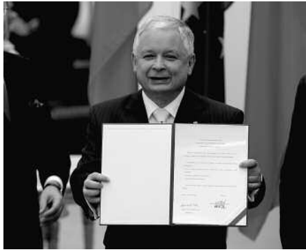
Poland's president, the late Lech Kaczyński, after signing the Lisbon Treaty last October.

The test of 'direct concern' is already the subject of abundant case law which indicates that the effect of the contested measure on the person's interests must not depend on the discretion of another person. Thus, if an act of the European Union requires a Member State to adopt implementing measures, and the State retains some discretion over the implementing measures to be adopted, direct concern is excluded. The requirement, in Article 263 TFEU, that the measure should not 'entail implementing measures' would appear to be tautologous. Its origin, however, lies in concerns such as those expressed by the Court of First Instance in T-177/01 Jégo-Quéré v Commission [2002] ECR II-2365 about the situation where a Union measure does not entail any national measure for its implementation. In that case the only